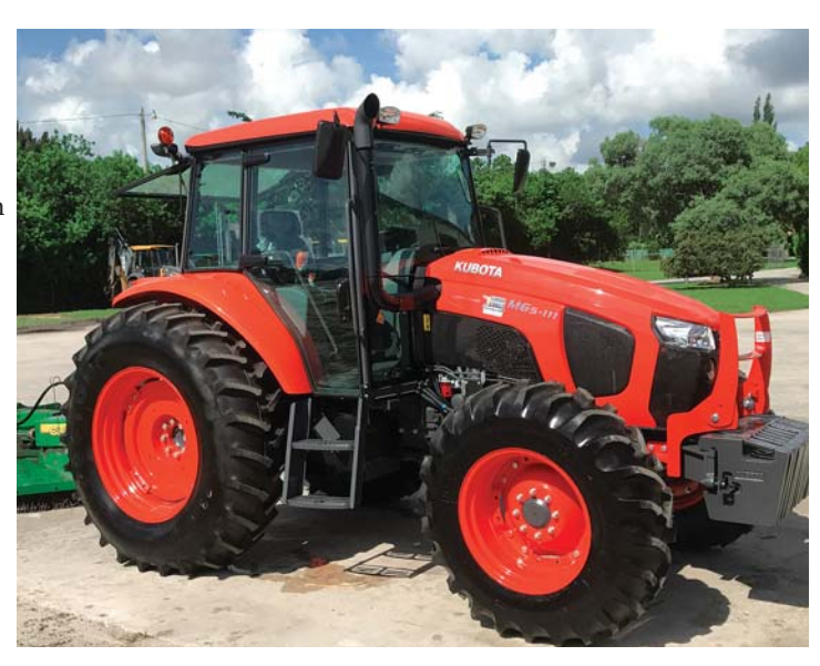
South Indian River Water Control District has added a new Kubota M6S Tractor to their fleet of vehicles

Our Driveway Culvert Replacement Program has been very productive. To date, we have installed 207 culverts and have 59 on schedule. This program allows the District to replace culverts at a cost of $300.00 for a standard install.