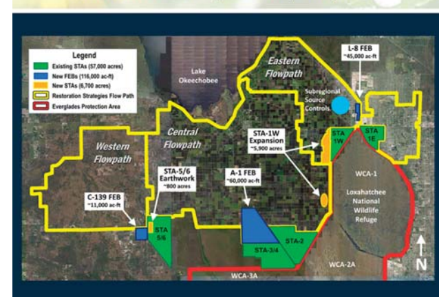
Final State Proposal of Key Projects and Components

Over the past year, the SFWMD and the ACOE have been conducting the alternative formulation and analysis process of the plan formation. This consisted of meeting to discuss alternative plan selections for determining the best project scenarios. A calibration report was produced to illustrate the existing watershed conditions at the same time that alternative project analyses are being conducted. As a result of these evaluations, further calibration was needed along with the processing of alternative models. SIRWCD has been attending these meetings along with participating in the modeling sub-team to ensure that SIRWCD's operations are being represented correctly within the modeling effort.