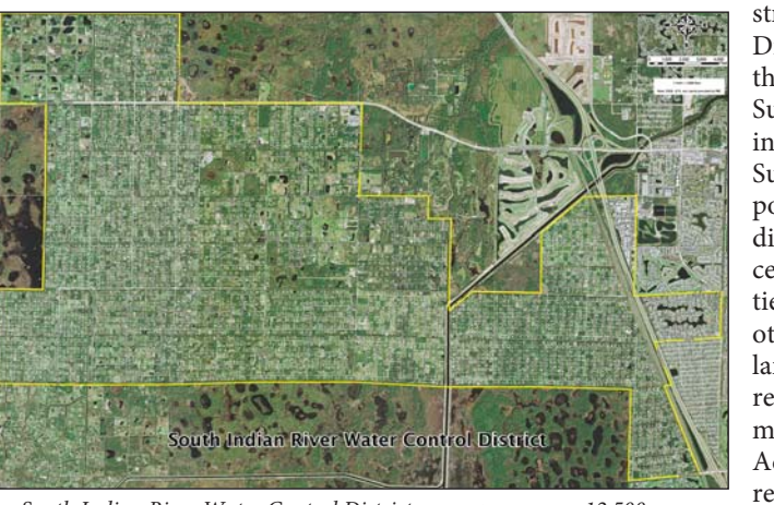
South Indian River Water Control District encompasses over 12,500 acres and is responsible for maintenance of canals, swales and roadways