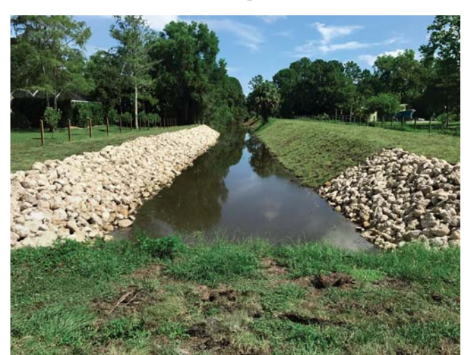
Canal 3 rip rap stabilization

This year, our focus has been clearing and recontouring outfall drainage swales, as well as making improvements to roadside swales. Roadside swales are part of