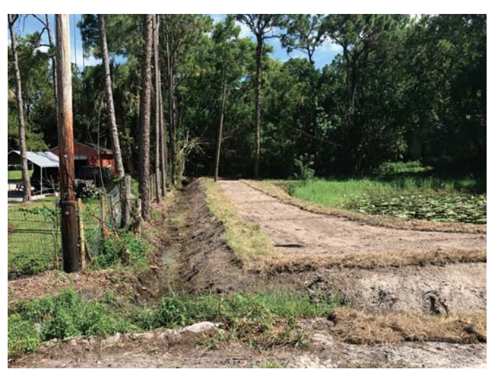
154th Street reclaimed outfall swale

Culverts under driveways have been aging over the years. These culverts are the landowner's responsibility to maintain and to replace them when their life span has ended. These culverts, when not maintained, are collapsing and blocking the secondary drainage system of the District. The District has instituted a culvert replacement program which allows the landowners to pay the District for the replacement of their culverts. This year, the District installed 207 culverts.